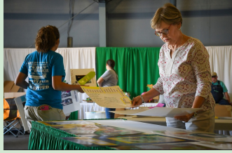
Exhibit Day & Exhibit Display Check-Out Volunteers Needed! We need adults and youth! Click HERE to sign-up to help.