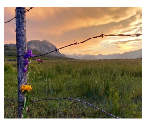
2024 Junior Grand Champion