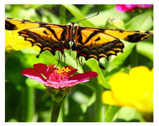
2024 Intermediate Grand Champion